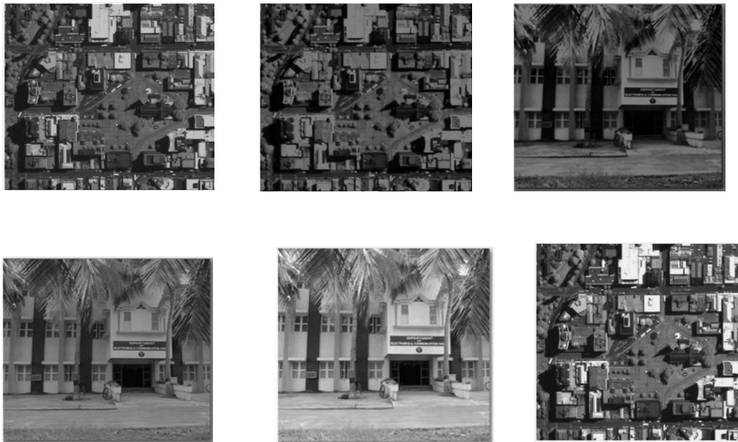
Fig 2.(a) ,(b) Gray Scale Low Resolution input Images.(c),(d) DWT & Bicubic interpolation images , (e),(f) are Optimized wavelet decomposition and bicubic interpolation images

Also an energetic broker directing in order to typically the fake positive remains in order to be inside a energetic together with possibility p+ , more this may be inactive. Subsequent choosing the filtration system rapport which achieve highest PSNR ideals, pictures are decomposed straight into low complete (regions) and higher move (edges) items along with apply the particular bicubic interpolation after that use the inverse wavelet transform in order to write the interpolated sub-bands into higher image resolution picture. The related pictorial results and PSNR results are shown in figures a few &3 respectively.